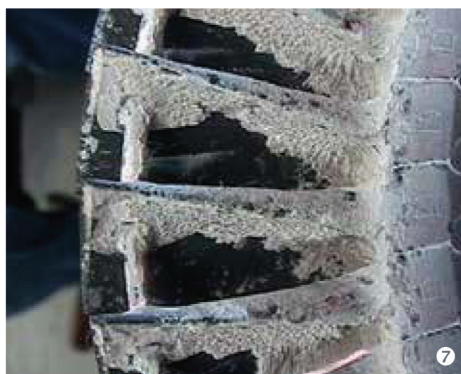
Siloxane build up on turbocharger turbine wheel