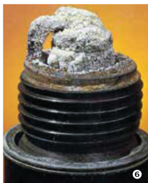
Spark plug contaminated with siloxanes

In some cases, it may be more attractive to owners to defer on the installation costs associated with advanced fuel treatment systems, and accept the operating costs associated with shorter maintenance and overhaul intervals. This 'pay me now or pay me later' dilemma is often decided based on a developer's assessment of risk and reward.