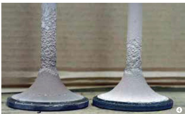
Exhaust valve with Siloxane buildup

While effective at reducing contaminants in the fuel, fuel treatments do add to biogas-to-energy system capital costs, add parasitic loads to the system, and require additional maintenance materials and labor.