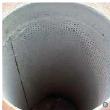
Inside of a muffler with siloxane residue